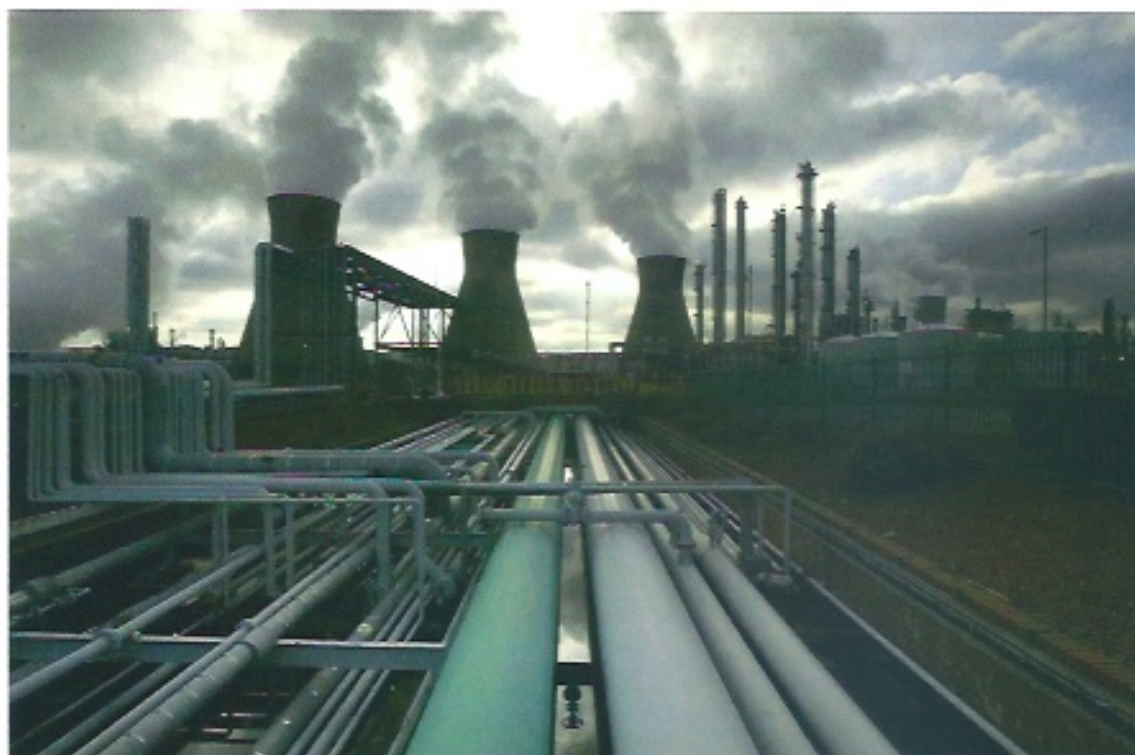
Grangemouth oil refinery, Scotland.